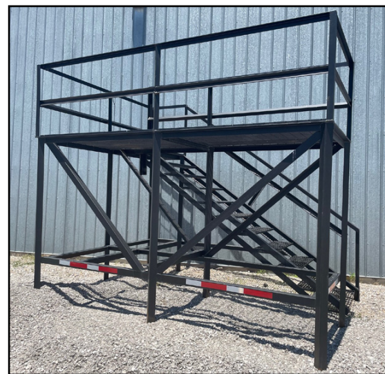
Elevated Mobile Wash System

Once we built the structure, the staff can clean trucks, spreaders and equipment on a safer surface, which in turn, gives them peace of mind that they are safe and it makes them faster. All they have to do is walk up the steps to spray of the tops of the equipment and inside of the spreaders. Our staff is more likely to do a better job because they feel safe and are not in a hurry to get down. This in turn, means our equipment will stay in better working order as well.