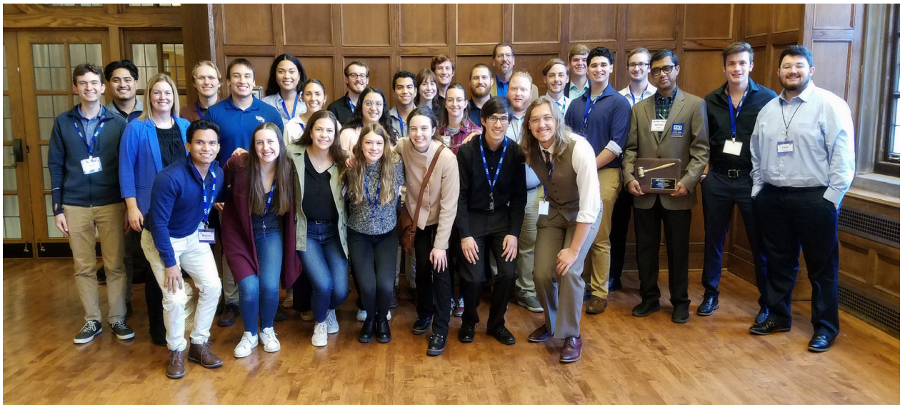
Student ASCE members pose for a photo at CEPDS.