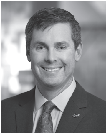
David A. Ricks Chair and Chief Executive Officer of Eli Lilly and Company

Dave Ricks is chair and chief executive officer of Eli Lilly and Company. A Lilly veteran for more than 25 years, with experience in marketing, sales, drug development and international operations, Dave became CEO in January 2017 and was elected chair of the company's board of directors effective June 2017.