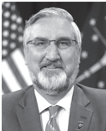
ERIC HOLCOMB Governor of Indiana

Eric J. Holcomb, 51st Governor of the State of Indiana, is a lifelong Hoosier and veteran of the U.S. Navy. Elected by his fellow Hoosiers to a second term in 2020, he received the most votes for governor in Indiana history.