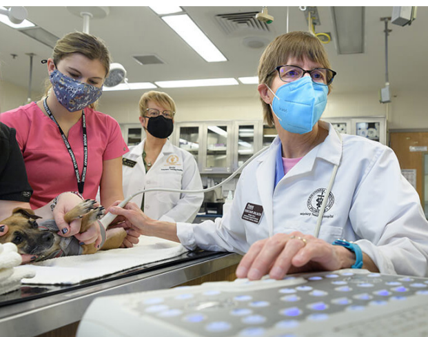
The Purdue Institute for Cancer Research is the nation's only National Cancer Institute basic laboratory cancer center that includes a college of veterinary medicine.

The Purdue Institute for Cancer Research continues to tackle complex basic discovery, using engineering in oncology to develop therapeutics and invent new drug delivery systems. The institute also is using artificial intelligence and machine learning to break ground in personalized medicine and drug development. All this is happening while the cancer institute is training hundreds of future cancer scientists.